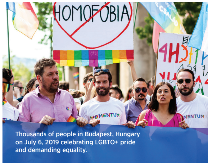
Thousands of people in Budapest, Hungary on July 6, 2019 celebrating LGBTQ+ pride and demanding equality.

This persistence is emblematic of both ADF and ADFI's strategic approaches. In the United States, ADF has waged a decades-long effort to overturn Roe v. Wade , which made abortion legal in 1973. The American Supreme