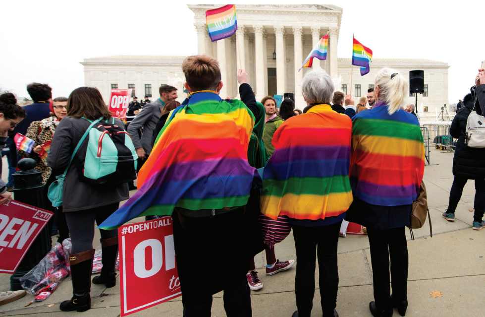
Supporters of LGBTQ+ equality outside the United States Supreme Court on Dec. 5, 2017, the morning of oral arguments in the Masterpiece Cakeshop v. Colorado Civil Rights Commission .